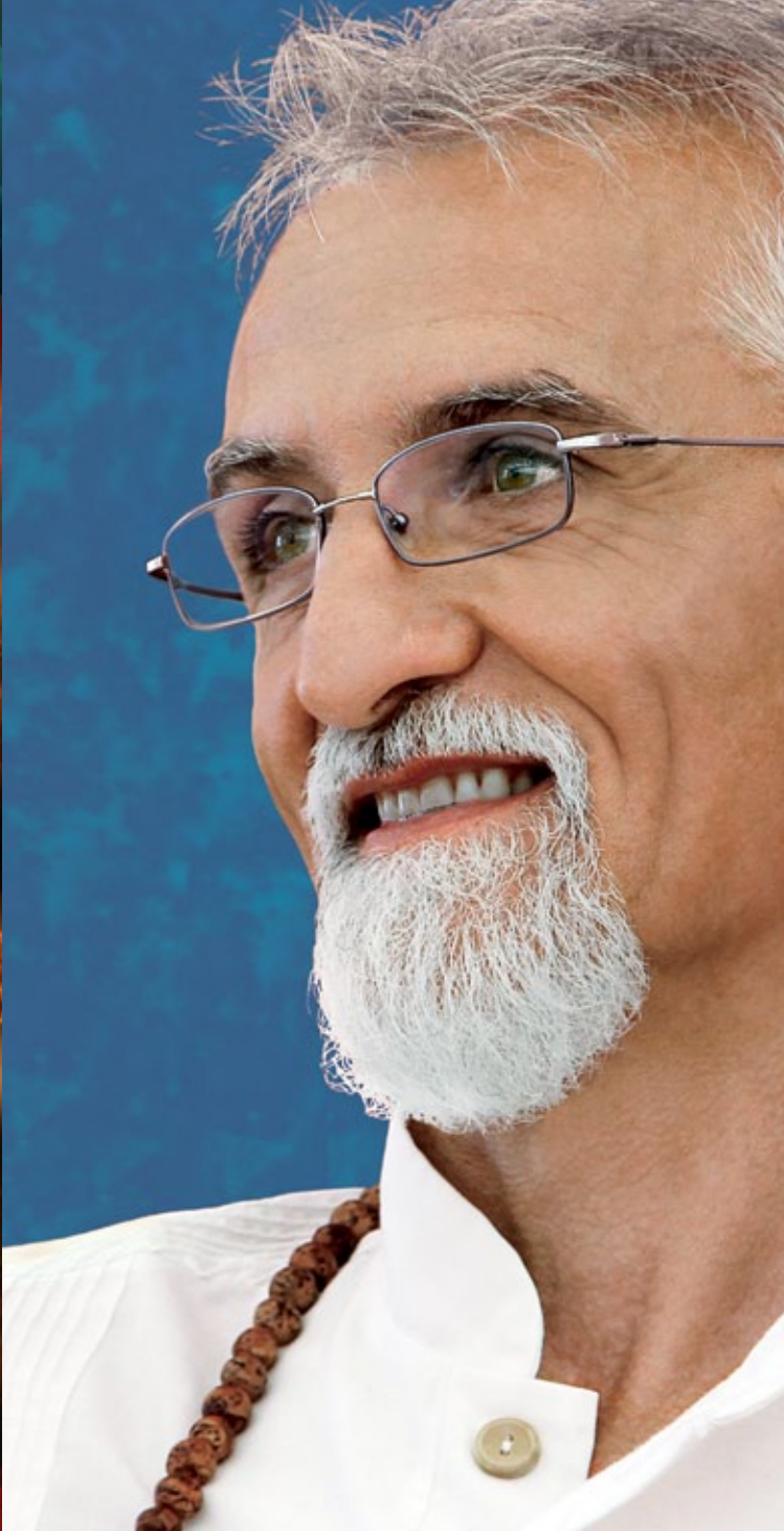
The whole man was created in the image of God. Some parts are not less in the image of God and some more.